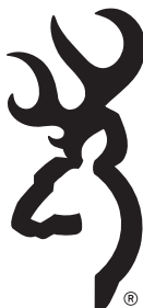
BUCKMARK LOGO (B_BUCKMARK.xxx)