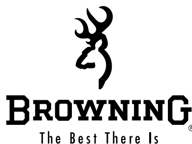
OVER AND UNDER SIGNATURE WITH TBTI TAGLINE (B_BROWNING_TBTL.xxx)